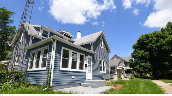
591 S Elm Street, adjacent to East River Street in Kankakee is home to the first Strong Neighborhood project.